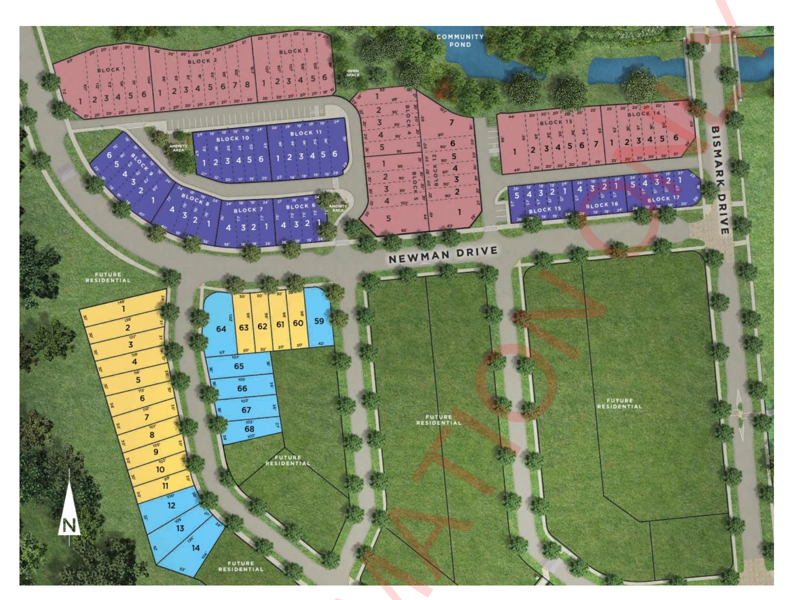
All plans and dimensions are approximate and subject to change at the discretion of the Vendor. Landscaping, road patterns and sidewalks are proposed only, and may change. Lot conditions and grading based upon preliminary engineering and is subject to change without notice. Plan is artist's concept. E. & O.E.